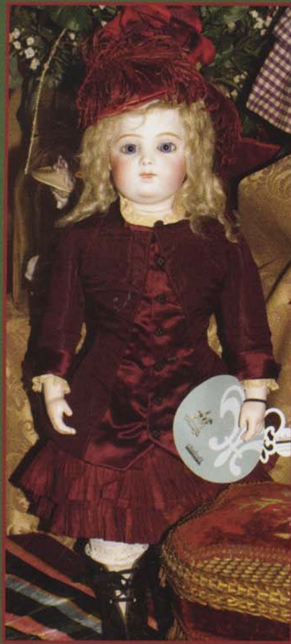
Bru Brevete, size 3, 19 inches, perfect bisque hands, $15,500.