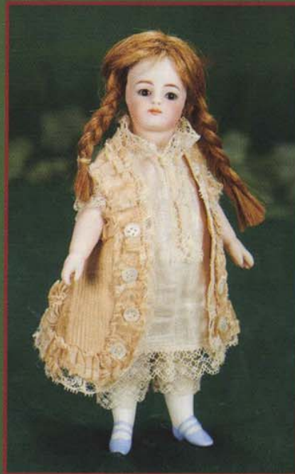
Mignonette by Simon & Halbig for the French market, c. 1880, 7-1/2 inches tall, original dress, $6,000.