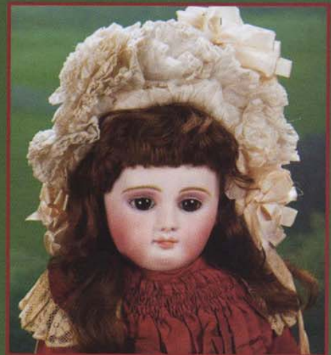
Mothereau, size 9, 24 inches, c. 1885, $19,000.