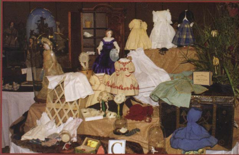
Suzanne Amaryllis, a 14" Rohmer with a signed trunk and trousseau, brought $19,000. The doll came from its original estate in Rouen, France where it resided for 150 years.