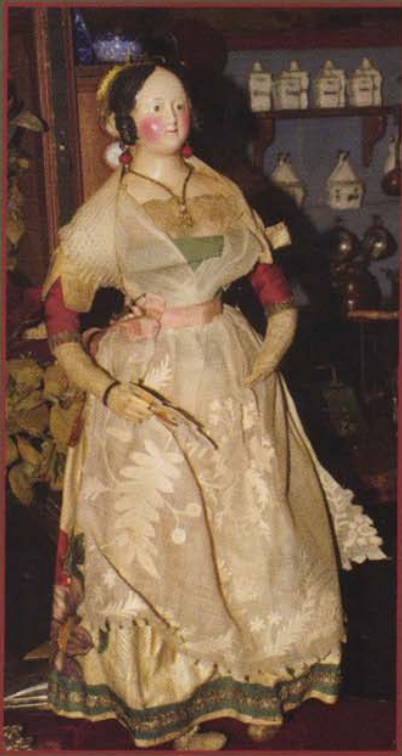
A circa 1820's papier mache, made for the French market, wearing her original costume with early transfer print designs on the skirt, and an elaborate embroidered apron, $5,400.