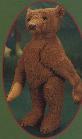
A very special bear by Steiff, this is the earliest model made, c. 1900-1901, with metal rod armature, 17 inches tall, $21,000.