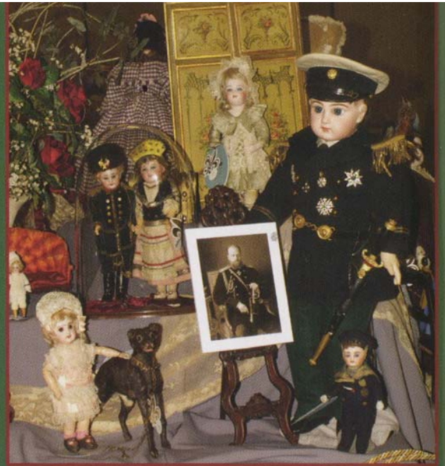
This impressive 26-inch Tete Jumeau in original dress regalia as Tsar Alexander III commemorates the signing of the Franco-Russian alliance in 1892. An exhibition doll, it remained in the original family since its making. It realized $23,000.