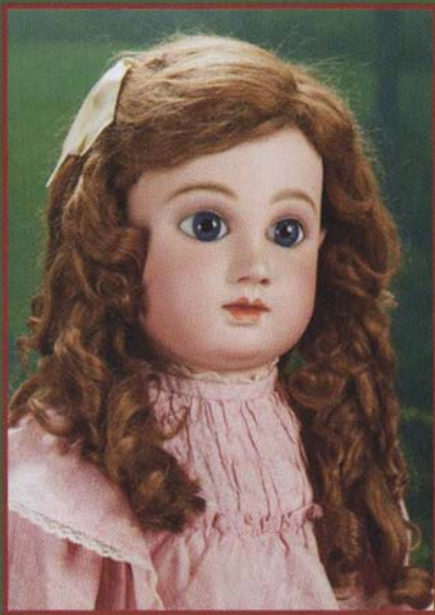
A series G Steiner, 29 inches tall, with its distinctive turned up nose, sold for $25,000.