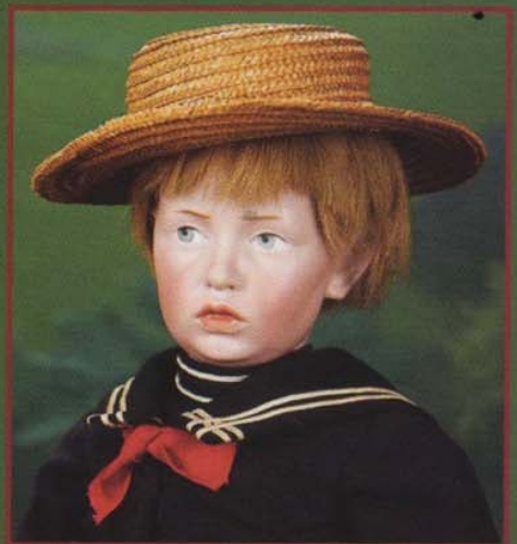
Due to a hidden break that is hidden by his wig, this 22 inch Karl, mold 107 by Kammer and Reinhardt, was an opportunity at $17,000.