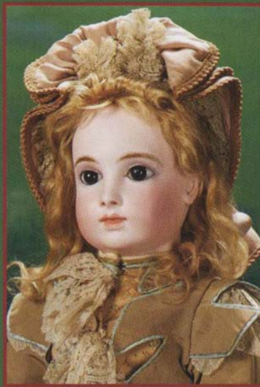
The auction top lot was this exceedingly rare Halopeau Bebe, 4 inches, marked 4 H, ex-collection Lucy Morgan, $65,000.