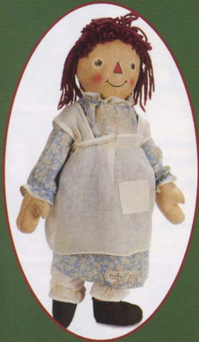
Very few of these Raggedy Ann's by the Exposition Doll and Toy Company were ever made. Circa 1935, this rare example brought $4,000.